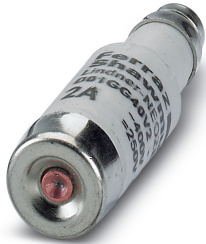
Fuse insert, nominal current: 2 A, length: 36 mm, diameter: 11 mm, color: pink

Please be informed that the data shown in this PDF Document is generated from our Online Catalog. Please find the complete data in the user's documentation. Our General Terms of Use for Downloads are valid ( http://phoenixcontact.com/download )