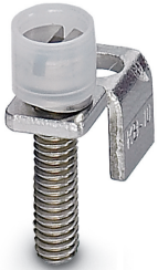
Chain bridge, number of positions: 1, color: silver

Please be informed that the data shown in this PDF Document is generated from our Online Catalog. Please find the complete data in the user's documentation. Our General Terms of Use for Downloads are valid ( http://phoenixcontact.com/download )