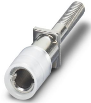
Test plug strip, number of positions: 1, color: white

Please be informed that the data shown in this PDF document is generated from our online catalog. Please find the complete data in the user documentation. Our general terms of use for downloads are valid.