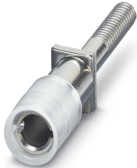
Female test connector, color: white

Please be informed that the data shown in this PDF Document is generated from our Online Catalog. Please find the complete data in the user's documentation. Our General Terms of Use for Downloads are valid ( http://phoenixcontact.com/download )