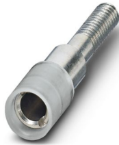
Test plug strip, number of positions: 1, color: gray

Please be informed that the data shown in this PDF document is generated from our online catalog. Please find the complete data in the user documentation. Our general terms of use for downloads are valid.