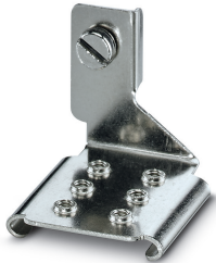
Screw holder, material: CuZn, for storing a maximum of 6 switch screws of the ISSB 10-6

Please be informed that the data shown in this PDF Document is generated from our Online Catalog. Please find the complete data in the user's documentation. Our General Terms of Use for Downloads are valid ( http://phoenixcontact.com/download )