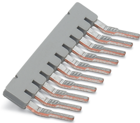
Insertion bridge, 10-pos., fully insulated

Please be informed that the data shown in this PDF Document is generated from our Online Catalog. Please find the complete data in the user's documentation. Our General Terms of Use for Downloads are valid ( http://phoenixcontact.com/download )