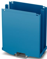
DIN rail housing, Lower housing part with metal foot catch, width: 50.1 mm, height: 100 mm, depth: 108.35 mm, color: blue (similar RAL 5015), cross connection: DIN rail connector (optional), number of positions cross connector: 8

Please be informed that the data shown in this PDF document is generated from our online catalog. Please find the complete data in the user documentation. Our general terms of use for downloads are valid.