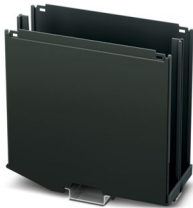
DIN rail housing, Lower housing part with metal foot catch, width: 50.1 mm, height: 122.5 mm, depth: 108.35 mm, color: black (similar RAL 9005), cross connection: DIN rail connector (optional), number of positions cross connector: 8

Please be informed that the data shown in this PDF document is generated from our online catalog. Please find the complete data in the user documentation. Our general terms of use for downloads are valid.