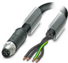
Power cable, 4-position, PUR halogen-free, black-gray RAL 7021, Plug straight M12, coding: S, on free cable end, cable length: 5 m, for AC current up to 12 A/690 V

Please be informed that the data shown in this PDF document is generated from our online catalog. Please find the complete data in the user documentation. Our general terms of use for downloads are valid.