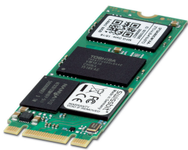
30 GB SATA III 60 mm M.2 SSD for industrial PPC and BPC products

Please be informed that the data shown in this PDF Document is generated from our Online Catalog. Please find the complete data in the user's documentation. Our General Terms of Use for Downloads are valid ( http://phoenixcontact.com/download )