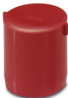
Closing cap, color: red

Please be informed that the data shown in this PDF document is generated from our online catalog. Please find the complete data in the user documentation. Our general terms of use for downloads are valid.