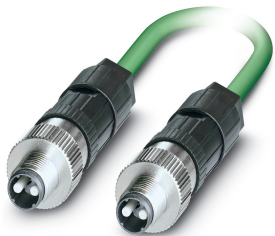
Assembled FO cable, breakout cable, 200/230 µm PCF-GI fiber, M12 to M12, for installation inside buildings, length: 1 m

Please be informed that the data shown in this PDF Document is generated from our Online Catalog. Please find the complete data in the user's documentation. Our General Terms of Use for Downloads are valid ( http://phoenixcontact.com/download )