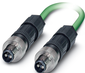
Assembled FO cable, round cable, 980/1000 µm POF fiber, M12 FO to M12 FO, for installation inside buildings, length: 2 m

Please be informed that the data shown in this PDF Document is generated from our Online Catalog. Please find the complete data in the user's documentation. Our General Terms of Use for Downloads are valid ( http://phoenixcontact.com/download )