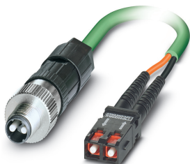
FO connecting cable, degree of protection: IP65/IP67, number of positions: 2, connection method: M12 circular connector

Please be informed that the data shown in this PDF Document is generated from our Online Catalog. Please find the complete data in the user's documentation. Our General Terms of Use for Downloads are valid ( http://phoenixcontact.com/download )