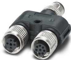
Y distributor for PSR-CT series RFID transponder switches, M12 male/female, 5- and 8-pos., for implementation of a manual start circuit in the field

Please be informed that the data shown in this PDF document is generated from our online catalog. Please find the complete data in the user documentation. Our general terms of use for downloads are valid.