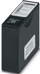
Replacement UV fluid, 23 ml, color: magenta

Please be informed that the data shown in this PDF Document is generated from our Online Catalog. Please find the complete data in the user's documentation. Our General Terms of Use for Downloads are valid ( http://phoenixcontact.com/download )