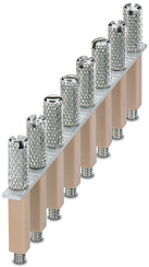
Fixed bridge, with knurled screws, pitch: 13 mm, number of positions: 8, color: silver

Please be informed that the data shown in this PDF Document is generated from our Online Catalog. Please find the complete data in the user's documentation. Our General Terms of Use for Downloads are valid ( http://phoenixcontact.com/download )