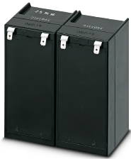
Replacement battery for UPS-BAT/VRLA... energy storage

Please be informed that the data shown in this PDF Document is generated from our Online Catalog. Please find the complete data in the user's documentation. Our General Terms of Use for Downloads are valid ( http://phoenixcontact.com/download )