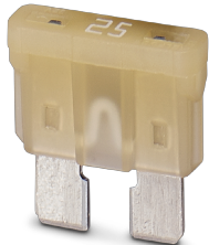
Fuse, nominal current: 25 A, length: 19 mm, width: 5 mm, height: 19.7 mm

Please be informed that the data shown in this PDF Document is generated from our Online Catalog. Please find the complete data in the user's documentation. Our General Terms of Use for Downloads are valid ( http://phoenixcontact.com/download )