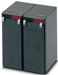
Replacement battery for UPS-BAT/VRLA... energy storage

Please be informed that the data shown in this PDF Document is generated from our Online Catalog. Please find the complete data in the user's documentation. Our General Terms of Use for Downloads are valid ( http://phoenixcontact.com/download )