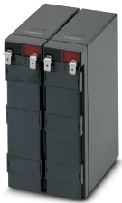
Replacement battery for UPS-BAT/VRLA... energy storage

Please be informed that the data shown in this PDF Document is generated from our Online Catalog. Please find the complete data in the user's documentation. Our General Terms of Use for Downloads are valid ( http://phoenixcontact.com/download )