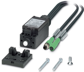
Door position switch with 1 m cable with M8 plug and 0.6 m cable with M8 socket (Snap-in), including mounting accessories

Please be informed that the data shown in this PDF Document is generated from our Online Catalog. Please find the complete data in the user's documentation. Our General Terms of Use for Downloads are valid ( http://phoenixcontact.com/download )