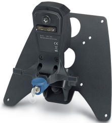
Rotatable/tiltable port replicator (with lock) for ITC 8113 xxx with 1x Ethernet (10/100/1000 Mbit) RJ45 and 4x USB 2.0.

Please be informed that the data shown in this PDF Document is generated from our Online Catalog. Please find the complete data in the user's documentation. Our General Terms of Use for Downloads are valid ( http://phoenixcontact.com/download )