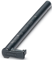
Battery for ITC 8113 xxx with 4 cells and charge level indicator.

Please be informed that the data shown in this PDF Document is generated from our Online Catalog. Please find the complete data in the user's documentation. Our General Terms of Use for Downloads are valid ( http://phoenixcontact.com/download )