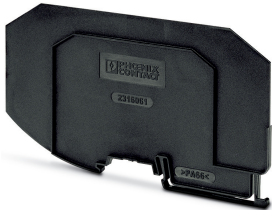
Fieldbus modular coupler partition plate

Please be informed that the data shown in this PDF Document is generated from our Online Catalog. Please find the complete data in the user's documentation. Our General Terms of Use for Downloads are valid ( http://phoenixcontact.com/download )