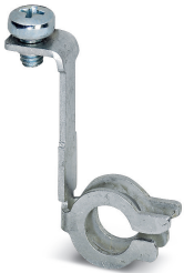
PE contact for UM-BASIC panel mounting base for connecting the PCB to the DIN rail at level 2

Please be informed that the data shown in this PDF Document is generated from our Online Catalog. Please find the complete data in the user's documentation. Our General Terms of Use for Downloads are valid ( http://phoenixcontact.com/download )