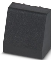
DIN rail housing, Filler plug for unoccupied terminal points (tall design), width: 21.35 mm, height: 19.65 mm, depth: 13.67 mm, color: black (similar RAL 9005)

Please be informed that the data shown in this PDF document is generated from our online catalog. Please find the complete data in the user documentation. Our general terms of use for downloads are valid.