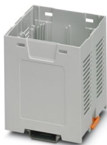
DIN rail housing, Lower housing part with base latch, tall design, with vents, width: 67.6 mm, height: 75 mm, depth: 87.3 mm, color: light grey (similar RAL 7035)

Please be informed that the data shown in this PDF document is generated from our online catalog. Please find the complete data in the user documentation. Our general terms of use for downloads are valid.