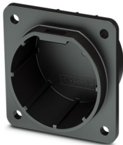
CHARX connect, Charging connector holder, Accessories, for vehicle charging connectors on charging stations (EVSE), GB/T, GB/T 20234.3, Front mounting, housing: black

Please be informed that the data shown in this PDF document is generated from our online catalog. Please find the complete data in the user documentation. Our general terms of use for downloads are valid.