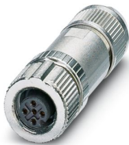
Data connector, CC link (10 Mbps), 4-position, shielded, Socket straight M12, coding: A, Push-lock spring connection, knurl material: Zinc die-cast, nickel-plated, external cable diameter 4 mm ... 8 mm

Please be informed that the data shown in this PDF document is generated from our online catalog. Please find the complete data in the user documentation. Our general terms of use for downloads are valid.