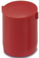
Closing cap, color: red

Please be informed that the data shown in this PDF document is generated from our online catalog. Please find the complete data in the user documentation. Our general terms of use for downloads are valid.