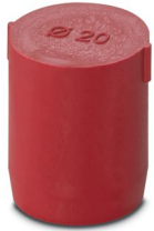
Closing cap, color: red

Please be informed that the data shown in this PDF document is generated from our online catalog. Please find the complete data in the user documentation. Our general terms of use for downloads are valid.