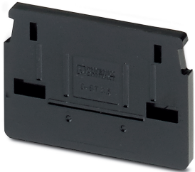
End cover, length: 46 mm, width: 3.5 mm, height: 30.7 mm, color: black

Please be informed that the data shown in this PDF Document is generated from our Online Catalog. Please find the complete data in the user's documentation. Our General Terms of Use for Downloads are valid ( http://phoenixcontact.com/download )