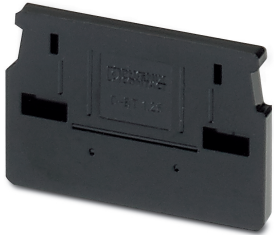
End cover, length: 42 mm, width: 3.5 mm, height: 26 mm, color: black

Please be informed that the data shown in this PDF Document is generated from our Online Catalog. Please find the complete data in the user's documentation. Our General Terms of Use for Downloads are valid ( http://phoenixcontact.com/download )