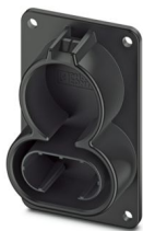
CHARX connect, Charging connector holder, Accessories, for vehicle charging connectors on charging stations (EVSE), CCS type 1, SAE J1772, Front mounting, housing: black

Please be informed that the data shown in this PDF document is generated from our online catalog. Please find the complete data in the user documentation. Our general terms of use for downloads are valid.