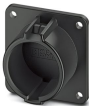
CHARX connect, Charging connector holder, Accessories, for vehicle charging connectors on charging stations (EVSE), Type 1, SAE J1772, Front mounting, housing: black

Please be informed that the data shown in this PDF document is generated from our online catalog. Please find the complete data in the user documentation. Our general terms of use for downloads are valid.