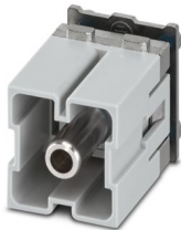
Contact insert module, number of positions: PE, power contacts: 0, control contacts: 0, Pin, Axial screw connection, 25 mm 2 ... 70 mm 2 , application: PE transmission

Please be informed that the data shown in this PDF document is generated from our online catalog. Please find the complete data in the user documentation. Our general terms of use for downloads are valid.