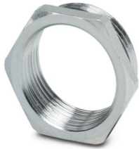
Reducing adapter, connecting thread: Pg21, color: silver, with O-ring

Please be informed that the data shown in this PDF document is generated from our online catalog. Please find the complete data in the user documentation. Our general terms of use for downloads are valid.