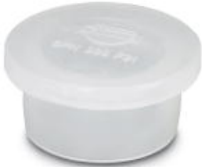
Protective cap plastic, for QPD-QUICKON connection 3(4) x 1.5 mm 2 , IP54

Please be informed that the data shown in this PDF Document is generated from our Online Catalog. Please find the complete data in the user's documentation. Our General Terms of Use for Downloads are valid ( http://phoenixcontact.com/download )