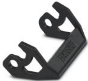
Replacement plastic single locking latch, for HC-EVO-D15.....BK housing

Please be informed that the data shown in this PDF Document is generated from our Online Catalog. Please find the complete data in the user's documentation. Our General Terms of Use for Downloads are valid ( http://phoenixcontact.com/download )