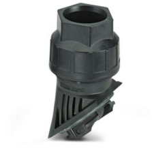
EVO plastic cable gland with bayonet locking; size M40, with filler plug

Please be informed that the data shown in this PDF document is generated from our online catalog. Please find the complete data in the user documentation. Our general terms of use for downloads are valid.