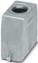
Sleeve housing B16, for single locking latch, material: Die-cast aluminum, salt water resistant, cable outlets: 1, straight, 1x Pg29, height: 76 mm, cable gland: none, Standard

Please be informed that the data shown in this PDF document is generated from our online catalog. Please find the complete data in the user documentation. Our general terms of use for downloads are valid.