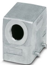
Sleeve housing B10, for double locking latch, material: Die-cast aluminum, salt water resistant, cable outlets: 1, lateral, 1x Pg16, height: 57 mm, cable gland: none, Standard

Please be informed that the data shown in this PDF document is generated from our online catalog. Please find the complete data in the user documentation. Our general terms of use for downloads are valid.