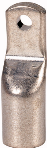
Cable lug, 240mm 2 , narrow type, size 3